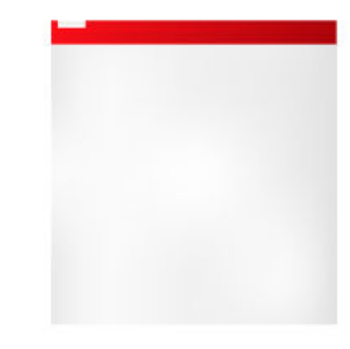
ONE GALLON CLEAR RESEALABLE PLASTIC STORGAE BAG