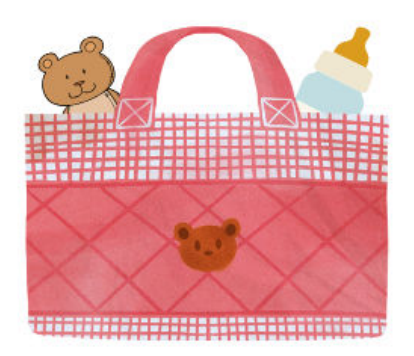
DIAPER BAG / MEDICAL BAG