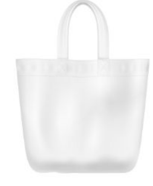
CLEAR TOTE 12" X 6" X 12" ANYTHING LARGER IS PROHIBITED