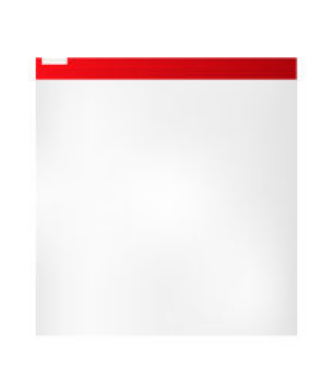
ONE GALLON CLEAR RESEALABLE PLASTIC STORGAE BAG