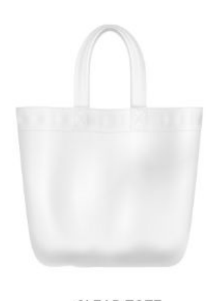
CLEAR TOTE 12" X 6" X 12" ANYTHING LARGER IS PROHIBITED