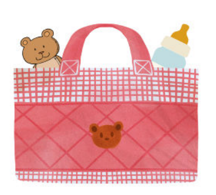
DIAPER BAG / MEDICAL BAG