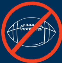
Footballs or other toys