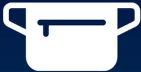
9x7 or smaller non clear bag