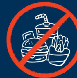
Outside Food and Drinks