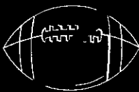
Footballs or other toys