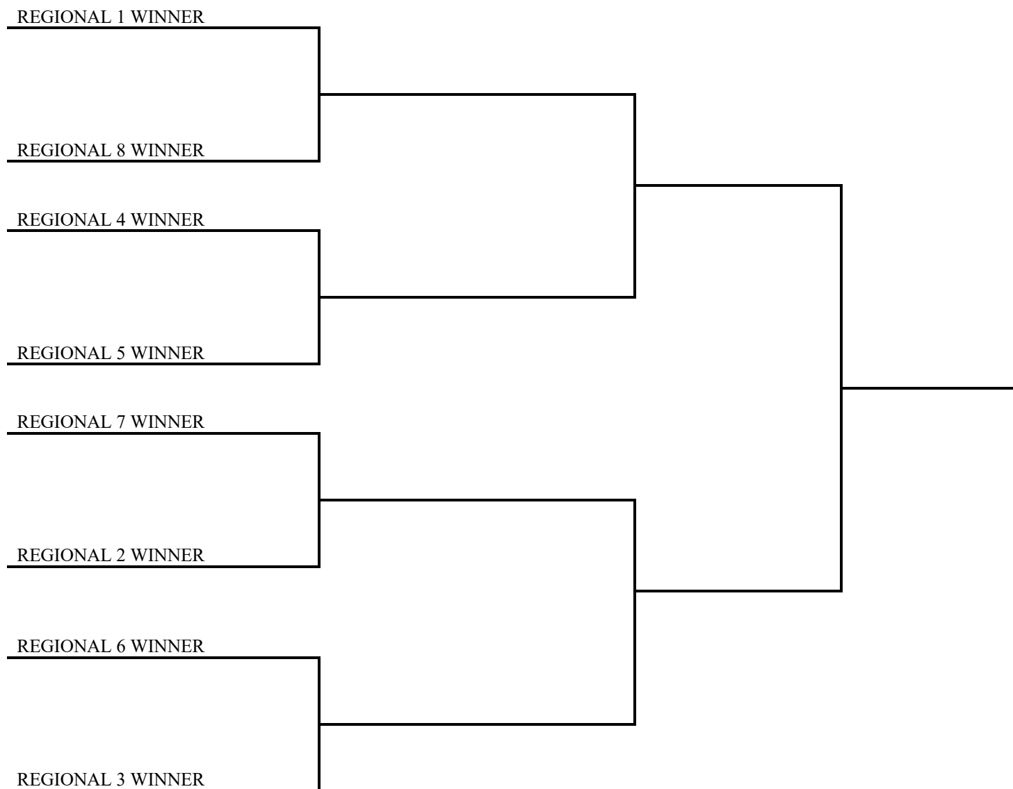
DIAGRAM 2—State Bracket for Class 5A and 6A